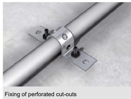
Fixing of perforated cut-outs