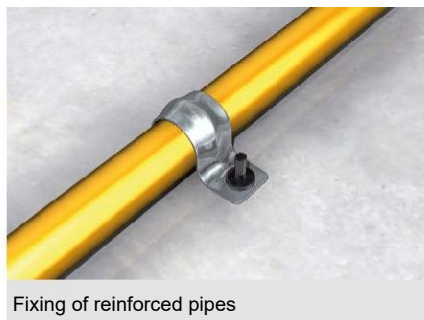
Fixing of reinforced pipes